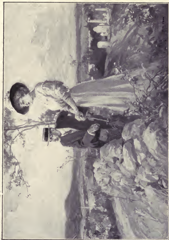
"Leaning on the uneven stones . . . they looked down at the roofs of the village."